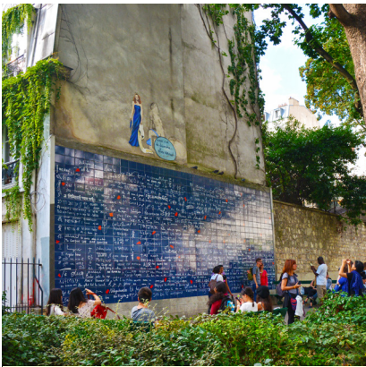
On this wall in Montmartre, 'I love you' is written in 250 different languages. Ask yourself: How would you illustrate a commitment to love others?

The scribe is reassured that Jesus gives the 'right' answer and echoes the importance of loving God and loving others. He recognises that these are the most important aspects of his faith. How might you complete the sentence, 'Love is...?'